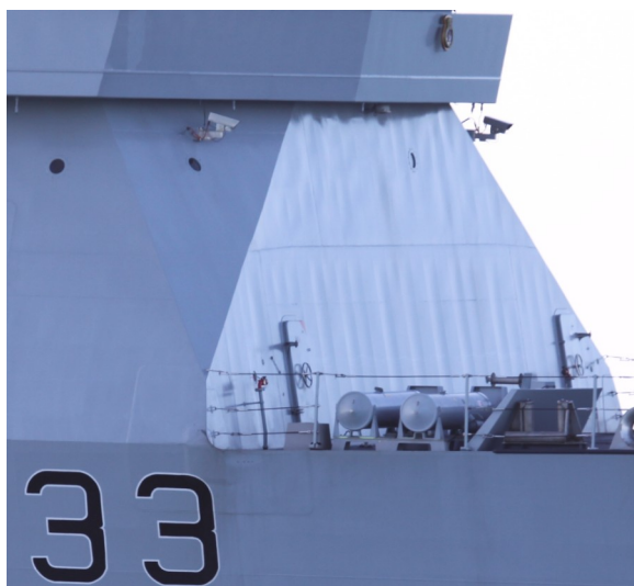
IDS300 launch tubes as fitted to UK RN Type 45 frigate

The decoy systems are designed and manufactured to meet specific requirements to match the performance and fighting tactics of the customers navy. These performance requirements are Radar Cross Section (RCS) values, the time required from firing to full effectiveness on the sea surface, and the duration that the decoy is required to remain effective on the sea surface.