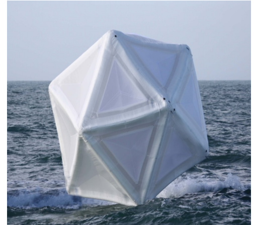
Variants of IDS300 naval decoy on the sea surface